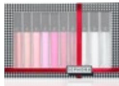
2 SEPHORA COLLECTION GLOSS LAB SET An experiment in lip color: three topcoats and seven glosses. $25 ($100 VALUE) Limited edition. Only at Sephora.