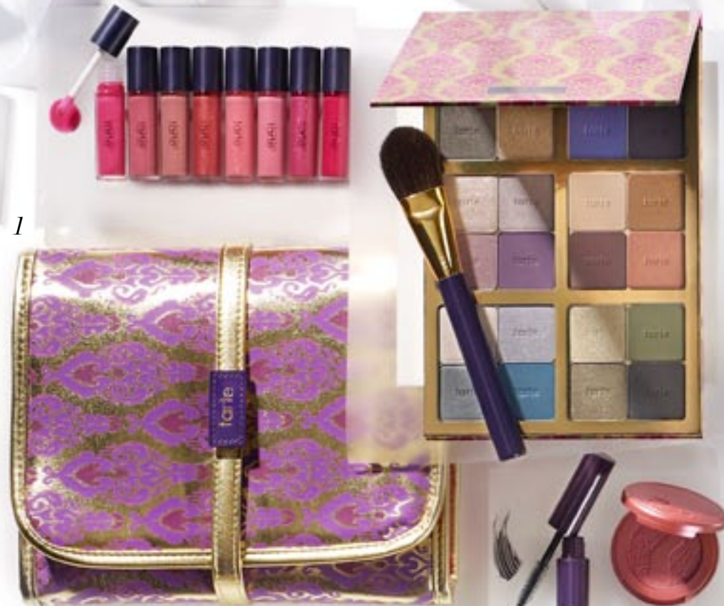
1 TARTE CARRIED AWAY WITH TARTE COLLECTOR'S SET AND ADVENTURER BAG Twenty-four shadows. Eight mini glosses. Plus: blush, powder, brush, and mini mascara. $54 ($512 VALUE) Limited edition. Only at Sephora.