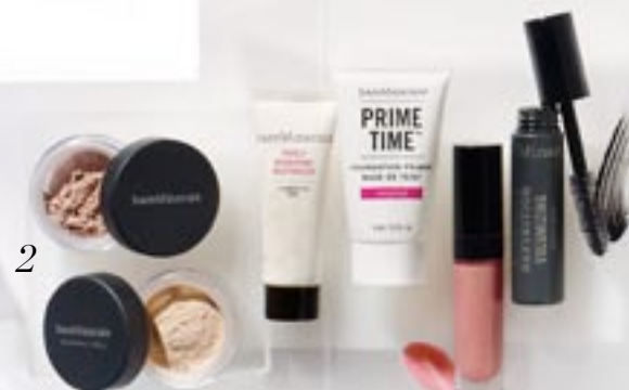
2 BAREMINERALS THE TOTAL PACKAGE SET Must-haves: primer, powder, moisturizer, and mini lip gloss and mascara. Plus, a voucher for a full-size foundation. $36 ($84 VALUE) Limited edition. Only at Sephora.