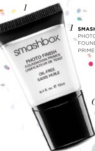
1 SMASHBOX PHOTO FINISH FOUNDATION PRIMER

STOP BY SEPHORA INSIDE JCP AND TAKE YOUR PICK OF ONE OF THESE THREE DELUXE SAMPLES.*