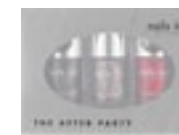
3 NAILS INC. THE AFTER PARTY SET Three brand-new glitter polishes in black, rainbow, and red. $25 Limited edition. Only at Sephora.