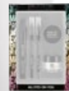
5 MAKE UP FOR EVER DAY TO NIGHT COLLECTION Demure meets dramatic: Two waterproof liners, mascara, creamy shadow, and travel-sized finishing powder. $59 ($98 VALUE) Limited edition. Only at Sephora.