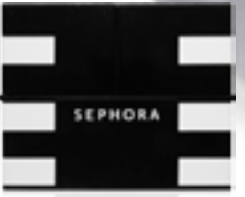
1 SEPHORA COLLECTION COLOR DAZE BLOCKBUSTER Includes 148 formulas, finishes, and textures for eyes, lips, and cheeks. $49.50 ($370 VALUE) Limited edition. Only at Sephora.