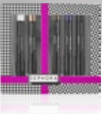
4 SEPHORA COLLECTION WATERPROOF JUMBO EYELINER SET Five liners so pigmented and thick, they double as shadows. $30 ($60 VALUE) Limited edition. Only at Sephora.