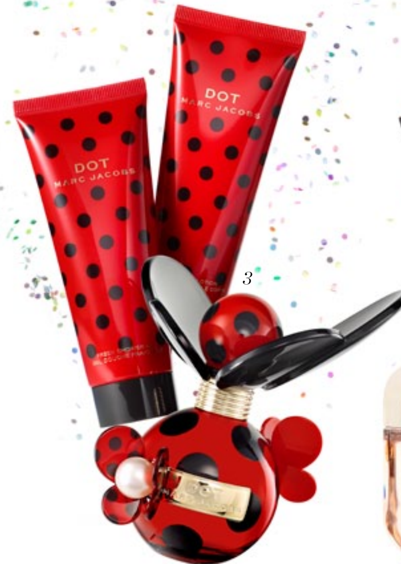
3 MARC JACOBS DOT HOLIDAY SET Eau de Parfum, body lotion, and shower gel. $72 ($111 VALUE)