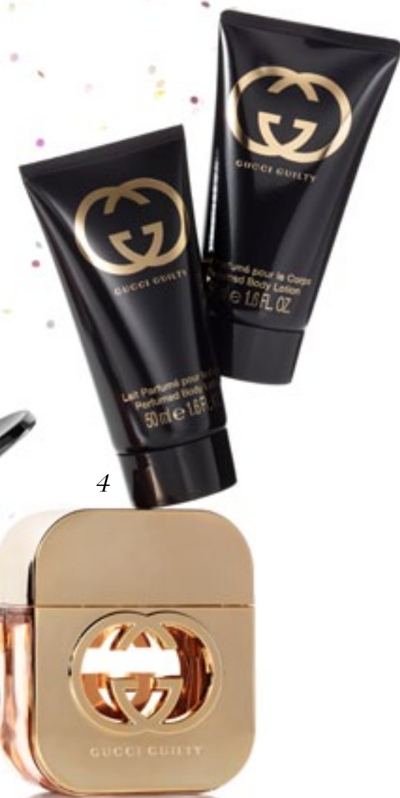
4 GUCCI GUILTY FOR HER SET Eau de Toilette and body lotion. $78 ($113 VALUE)