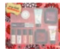
3 BENEFIT SEXY LITTLE STOWAWAYS 10 bestsellers for lips, cheeks, eyes, and face—perfectly sized for travel. $34 ($106 VALUE) Limited edition.