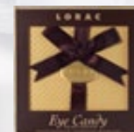
4 LORAC EYE CANDY FULL FACE COLLECTION Shadow, eyeliner, and lip palettes in a gilded box. $59 ($360 VALUE) Limited edition. Only at Sephora.