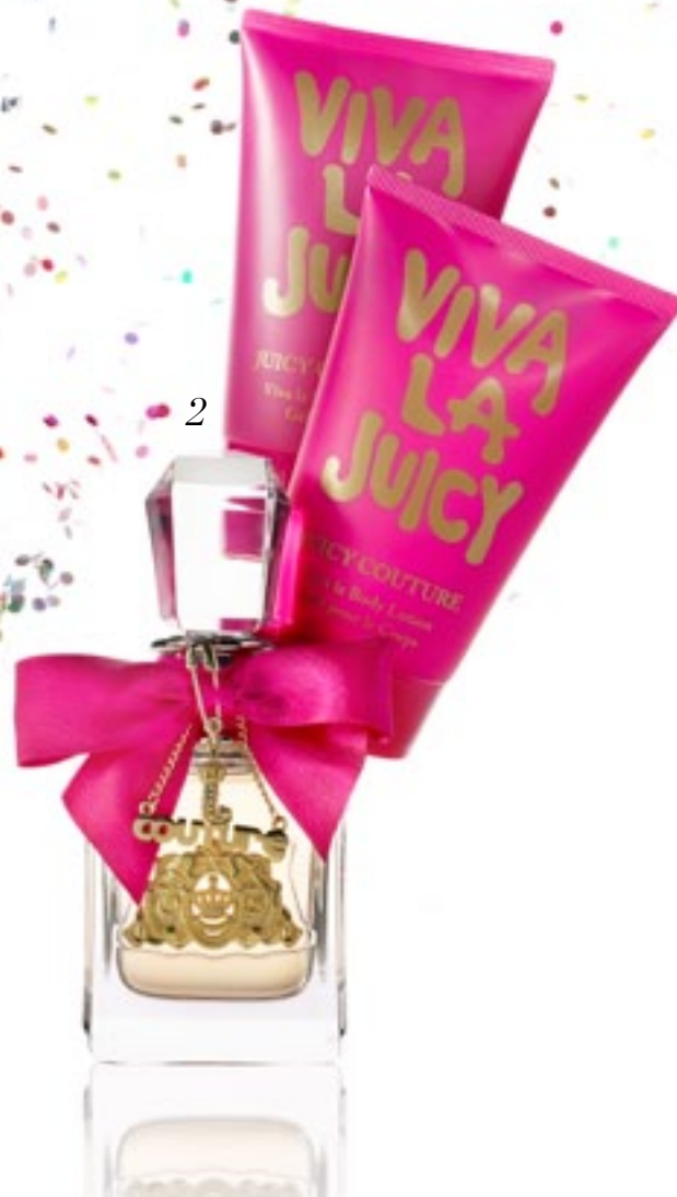
2 JUICY COUTURE VIVA LA JUICY HOLIDAY SET Eau de Toilette, body lotion, and shower gel. $75 ($110 VALUE)