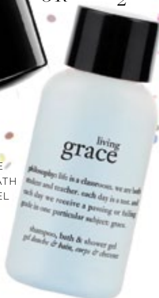
2 PHILOSOPHY LIVING GRACE SHAMPOO, BATH & SHOWER GEL