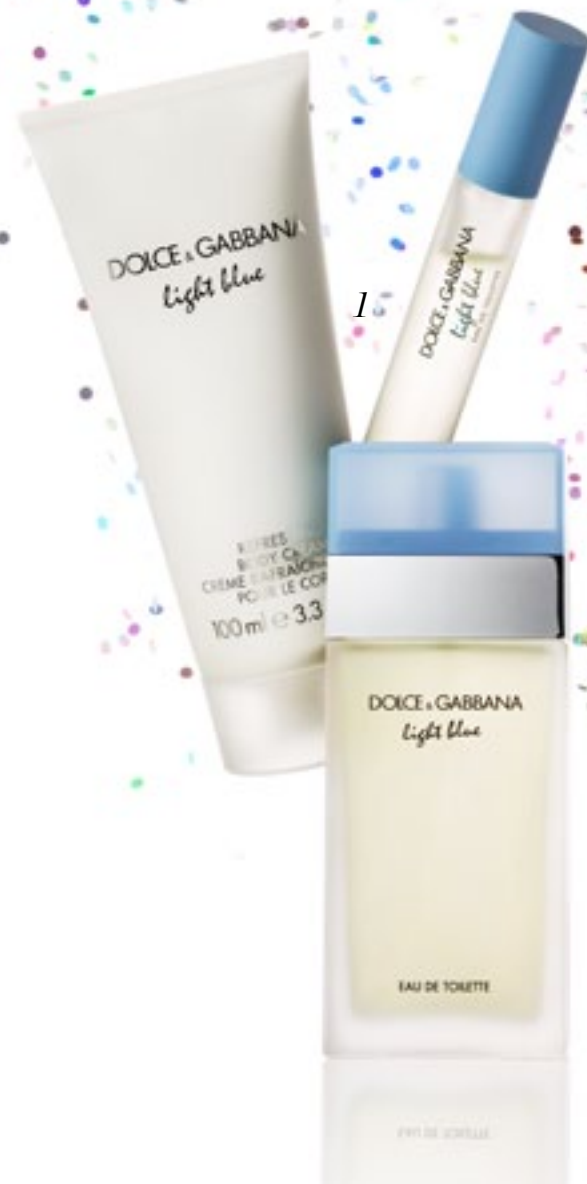
1 DOLCE&GABBANA LIGHT BLUE SET Eau de Toilette, body crème, and travel spray. $94 ($136 VALUE)