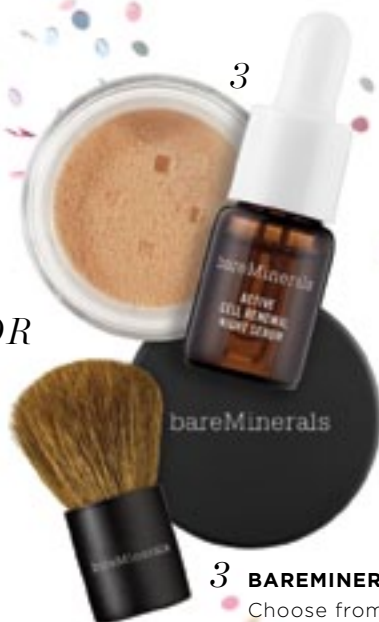
3 BAREMINERALS TRIO