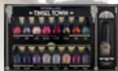
1 SEPHORA BY OPI TINSEL TOWN COLLECTOR'S SET Includes 16 mini polishes and a full-size jewel topcoat. $49.50 ($90 VALUE) Limited edition. Only at Sephora.