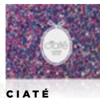
2 CIATÉ CAVIAR MINI BAR A collection for the manicure-obsessed: Four mini paint pots, and four mini caviar pearls. $29 Limited edition. Only at Sephora.